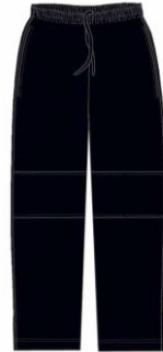
Jnr Track Pant